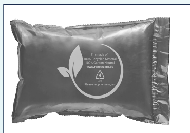
Carbon neutral air cushions