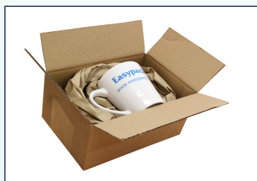
Paper cushioning & void fill

Pregis offers an array of paper, poly and air solutions to provide the right prescription of cushioning and containment to protect and enhance the value of your diverse product lines. We also design our packaging with mother nature in mind, offering materials with recycled content and recyclability to support your sustainability goals – and your customers.